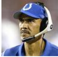
Tony Dungy at the Super Bowl on February 4, 2007.

With all the hoopla surrounding the inauguration of a new president, and Super Bowl just completed, and the untimely death of one of the great ladies of sport, Kay Yow, the story almost went unnoticed. The highly successful coach of the Indianapolis Colts of the National Football League was retiring, it said, and he would be moving on to pursue other interests.